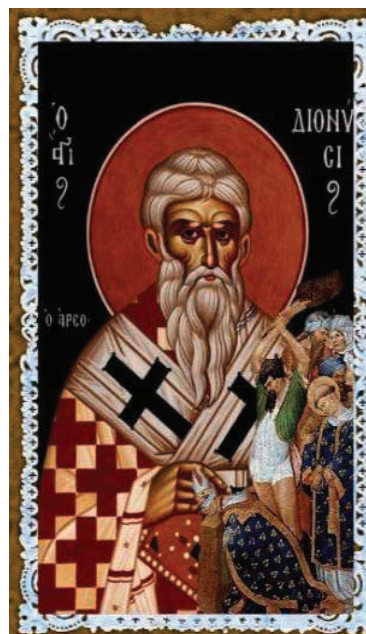
St. Denis and Companions

gifts to the altar and whether you would like the gifts to be placed in front of the first pew (if you are unable to walk the entire length of the center aisle