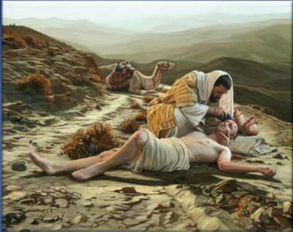
Luke 10 The Good Samaritan